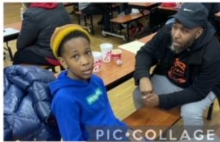
Eagles Gear and Eagles Green Day